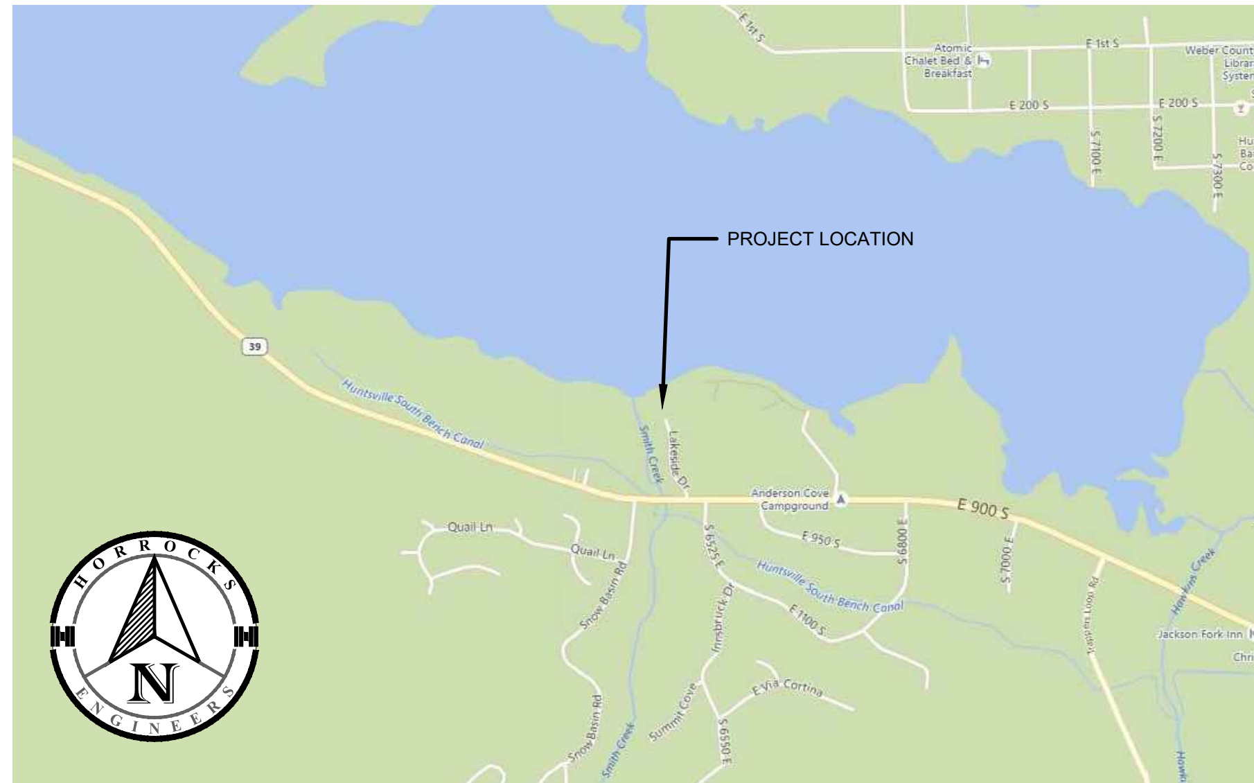
VICINITY MAP NO SCALE

THIS HAS BEEN REDLINED ON THE LAST 4 REVIEWS. IT IS IMPOSSIBLE TO HAVE THE NORTHWEST CORNER OF PHASE 1 AND THE NORTH LINE OF SR 39 BE THE SAME POINT.