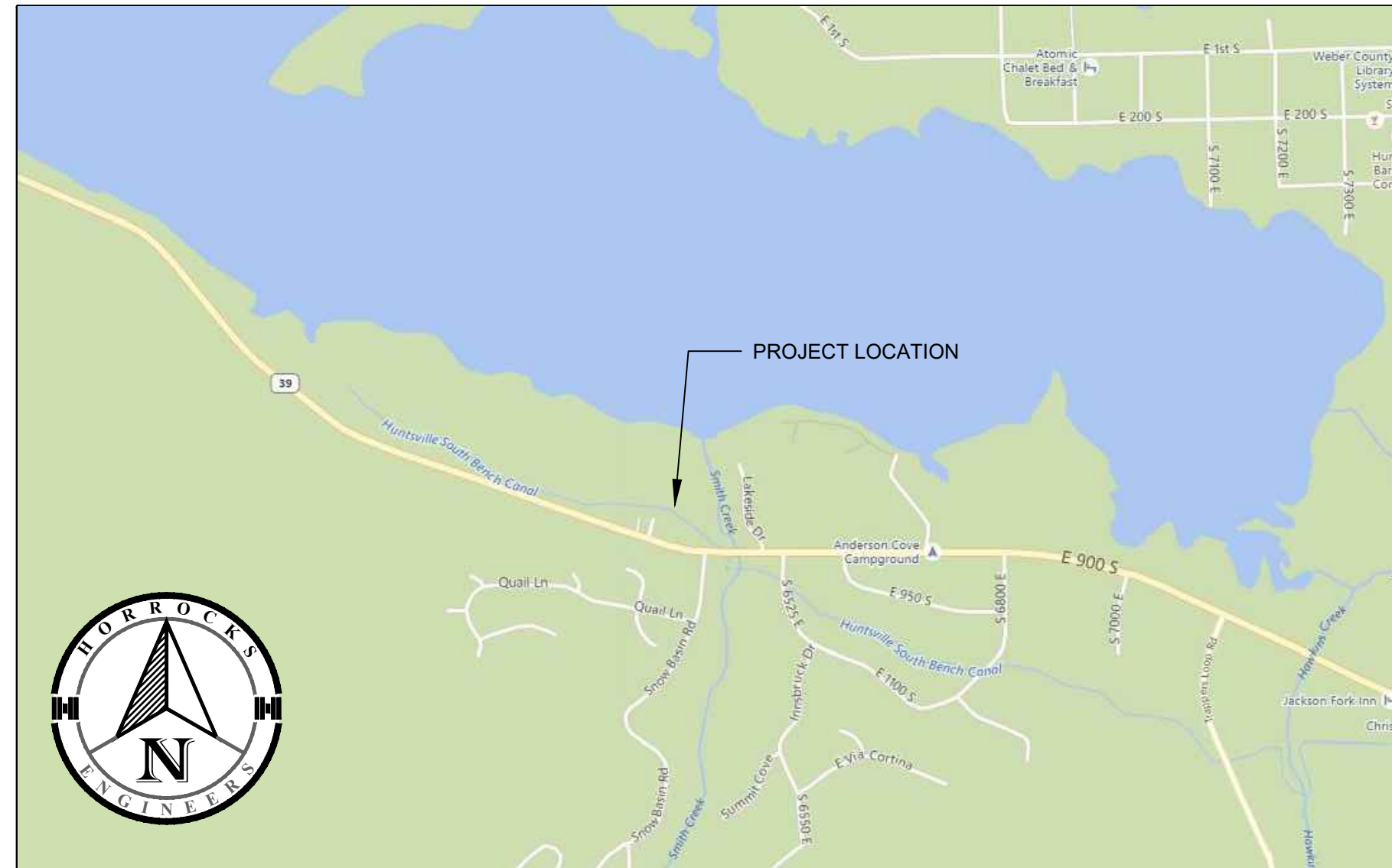
VICINITY MAP NO SCALE

THE BASIS OF BEARINGS FOR THIS PLAT IS THE SECTION LINE BETWEEN THE SOUTH QUARTER CORNER AND THE SOUTHWEST CORNER OF SECTION 13, TOWNSHIP 6 NORTH, RANGE 1 EAST, SALT LAKE BASE AND MERIDIAN, U.S. SURVEY. SHOWN HEREON AS N89°36'57"E