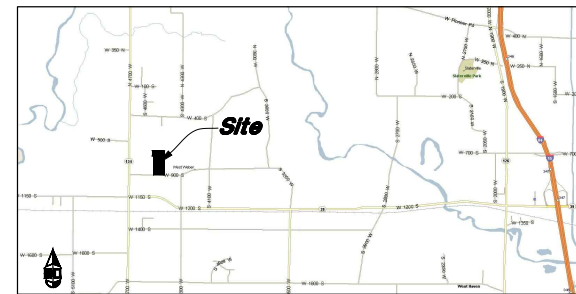
VICINITY MAP Not to Scale

Contains 755,373 Sq. Ft. or 17.341 Acres