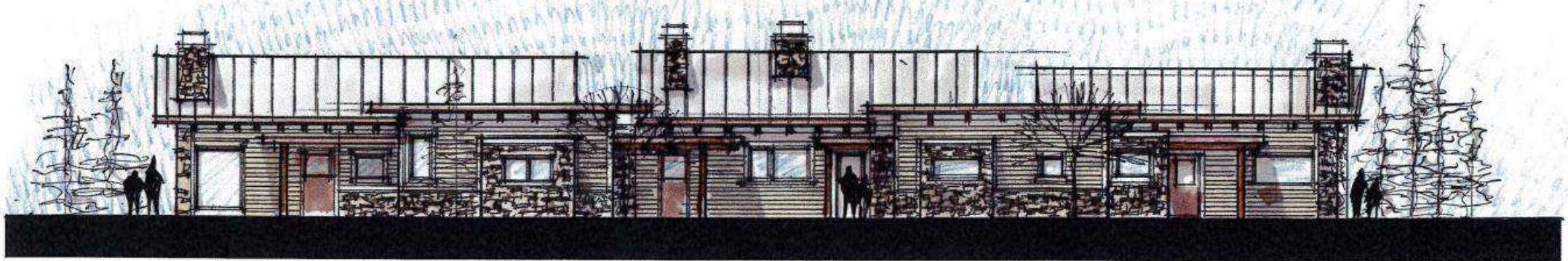
FRONT ELEVATION SCALE: 1/8" = 1'-0"