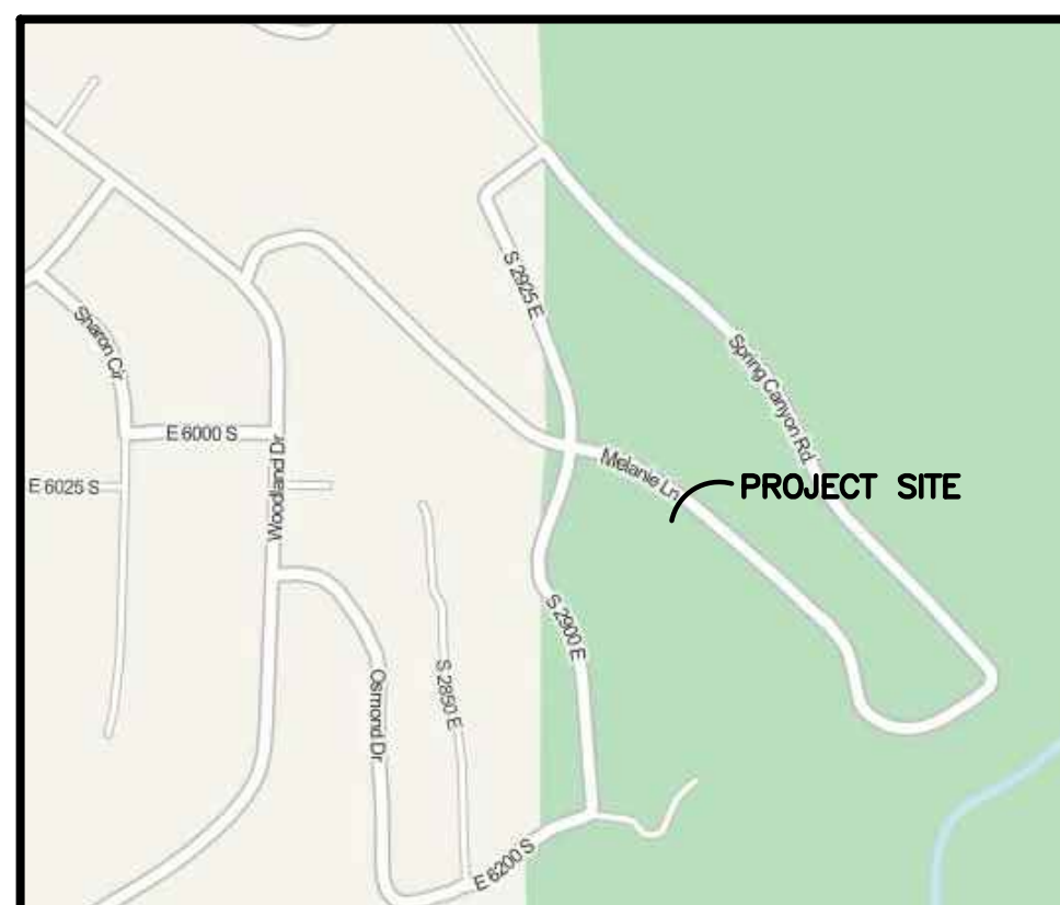
VICINITY MAP SCALE: NONE

The existing location, widths, and other dimensions of all existing or platted streets or railroad lines within and immediately adjacent (within 30') to the tract of land to be subdivided. WCO 106-1-5(a)(6)