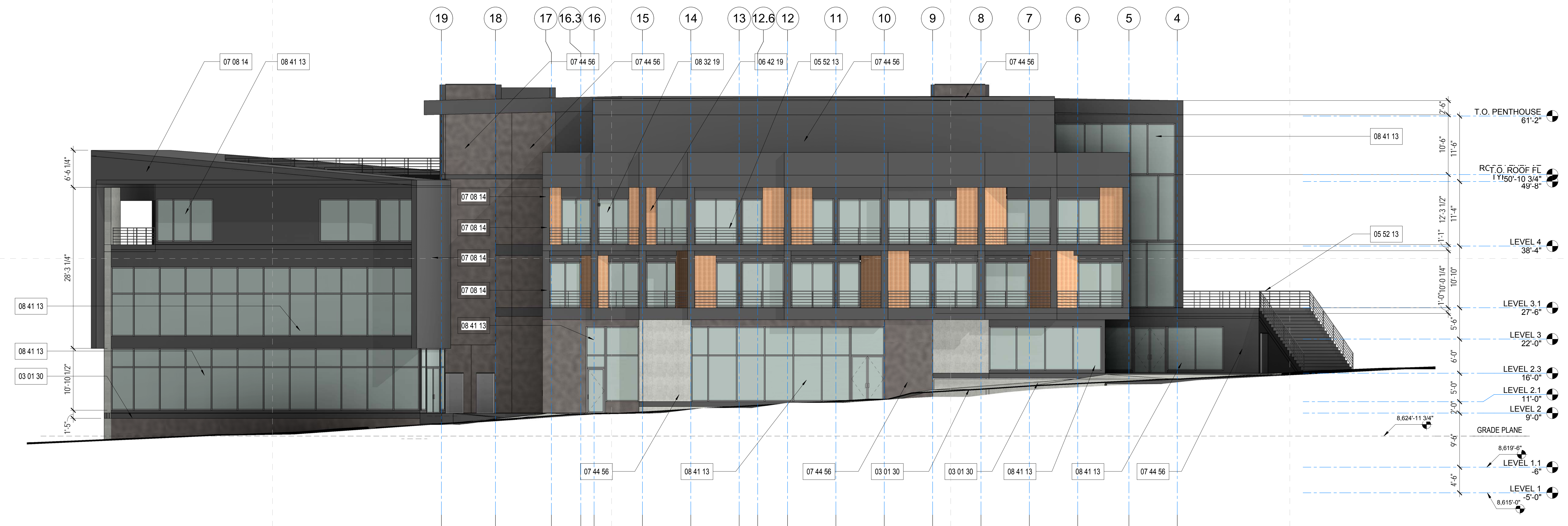
EAST ELEVATION 1/8" = 1'-0" 2

STAMP STATE OF UTAH CHRISTIAN ROBERT 10140001-0301 NOT FOR CONSTRUCTION UNTIL SIGNED BY THE ARCHITECT