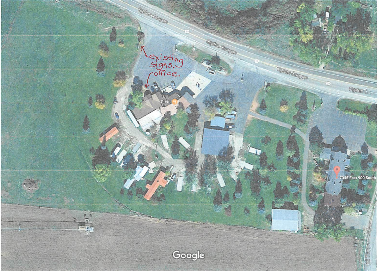
50 ft