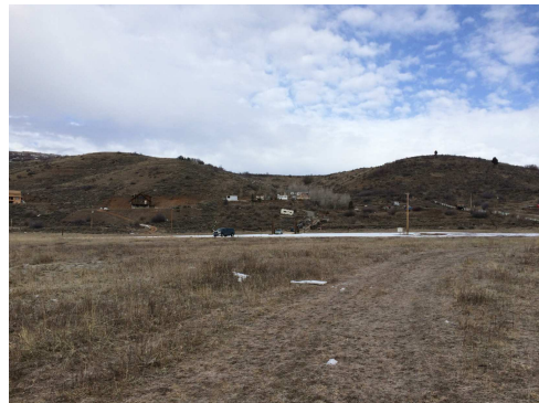
(ABOVE) PANORAMIC LOOKING SOUTH/WEST (LEFT) PARKING LOT LOOKING NORTH