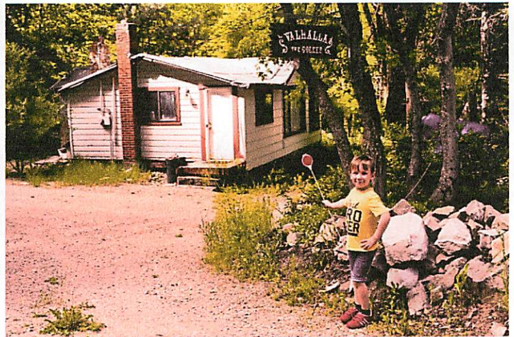
Figures 2a and 2b: Existing Cabin on property (circa 1930s), Front of property (left), Rear of property (right). Note driveway slope.