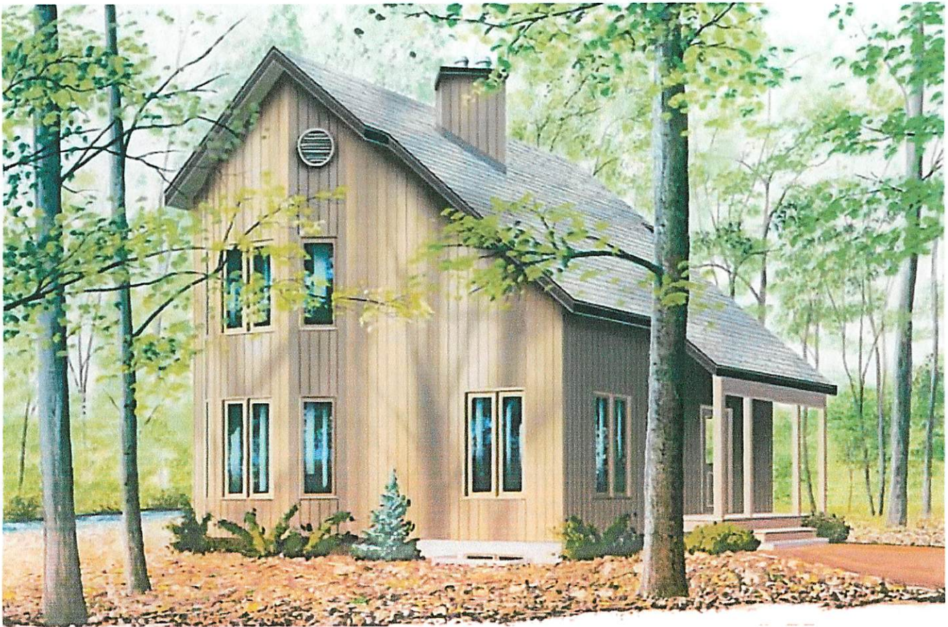
Figure 4: Artist rendition of planned remodel of existing structure (on same footprint)