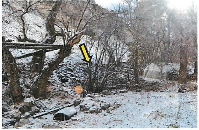
Fig. 3a: North end of lot (gently sloping entrance /driveway) Fig. 3b: South end of lot showing steep, rocky inclined area