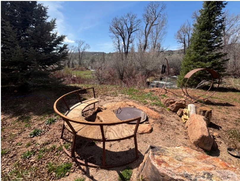
Updated fire pit now placed near a hydrant, surrounded by gravel and large rocks with a steel cover over a 48 inch deep rolled steel sleeve to trap oxygen when not in use and ensure all fires are “dead out”