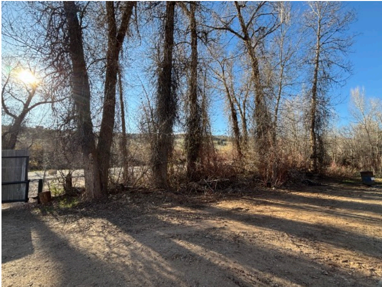
Area for dumpster North of entrance gate if/when needed (not expected with anticipated occupancy)