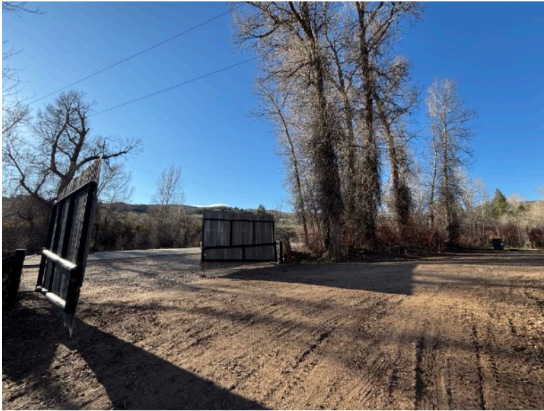
Entrance Gate - doubled in size per UDOT requirement - now 28 feet wide