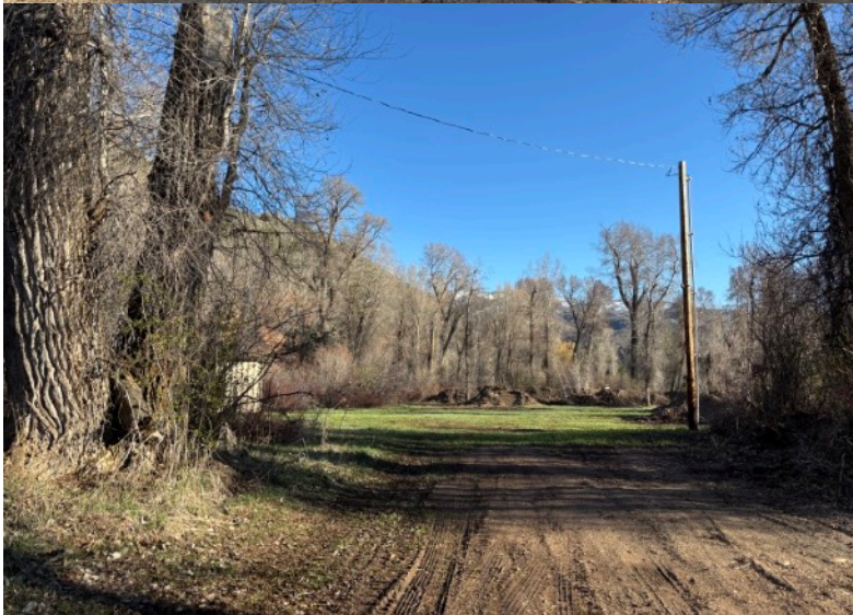
Road from entrance gate heading South to Parking area (along berms past power pole)