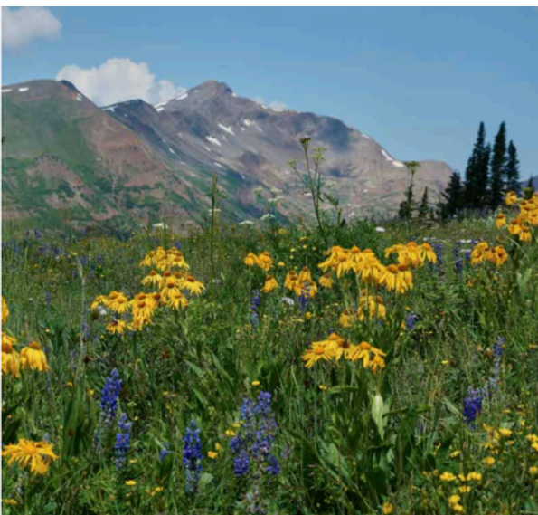
Utah wildflower mix planned for revegetation of all grassy areas this fall (enlisting help of the Yard Farmer landscape planner), to encourage return/support of native flora after years of sod and non native heavily fertilized grass