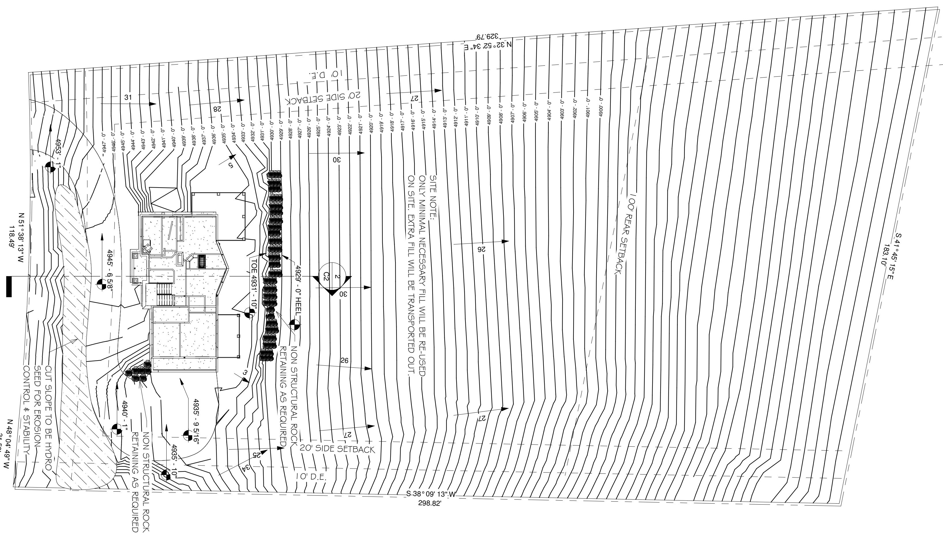
① Site Existing & Proposed Grade 1" = 20'-0"