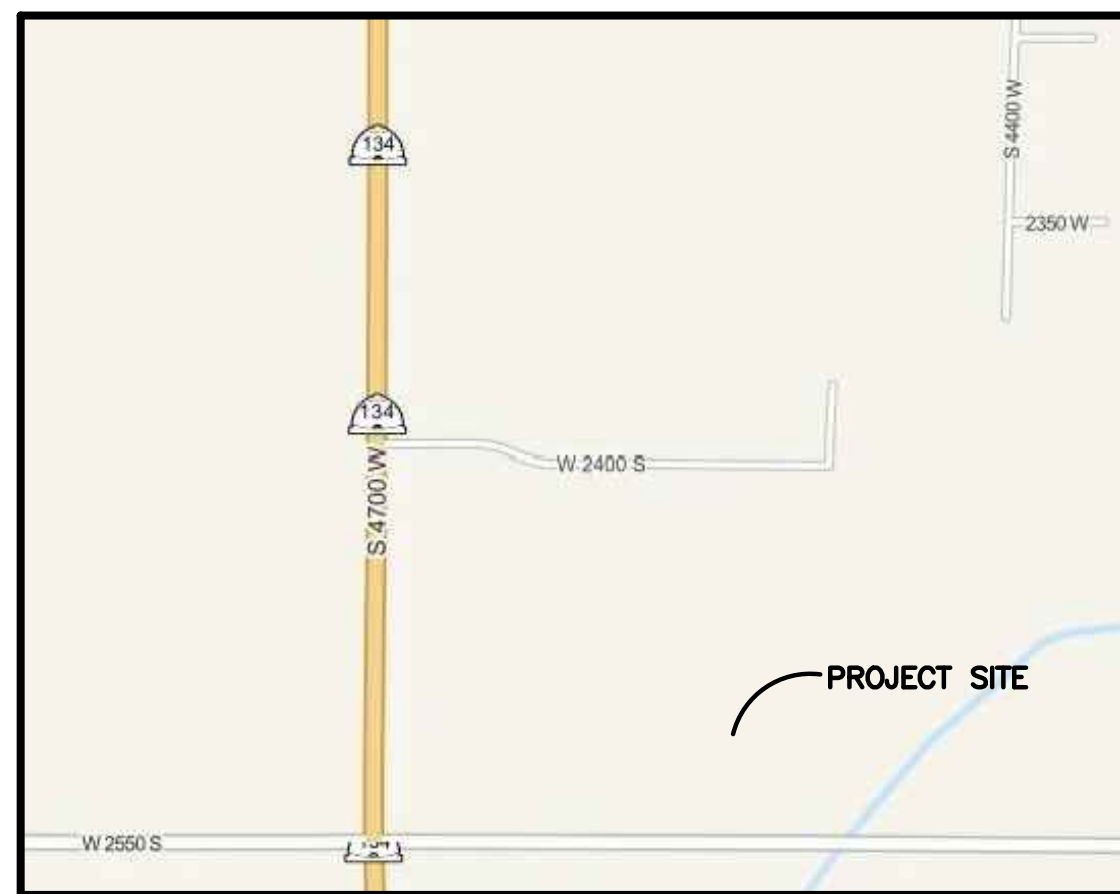
VICINITY MAP SCALE: NONE