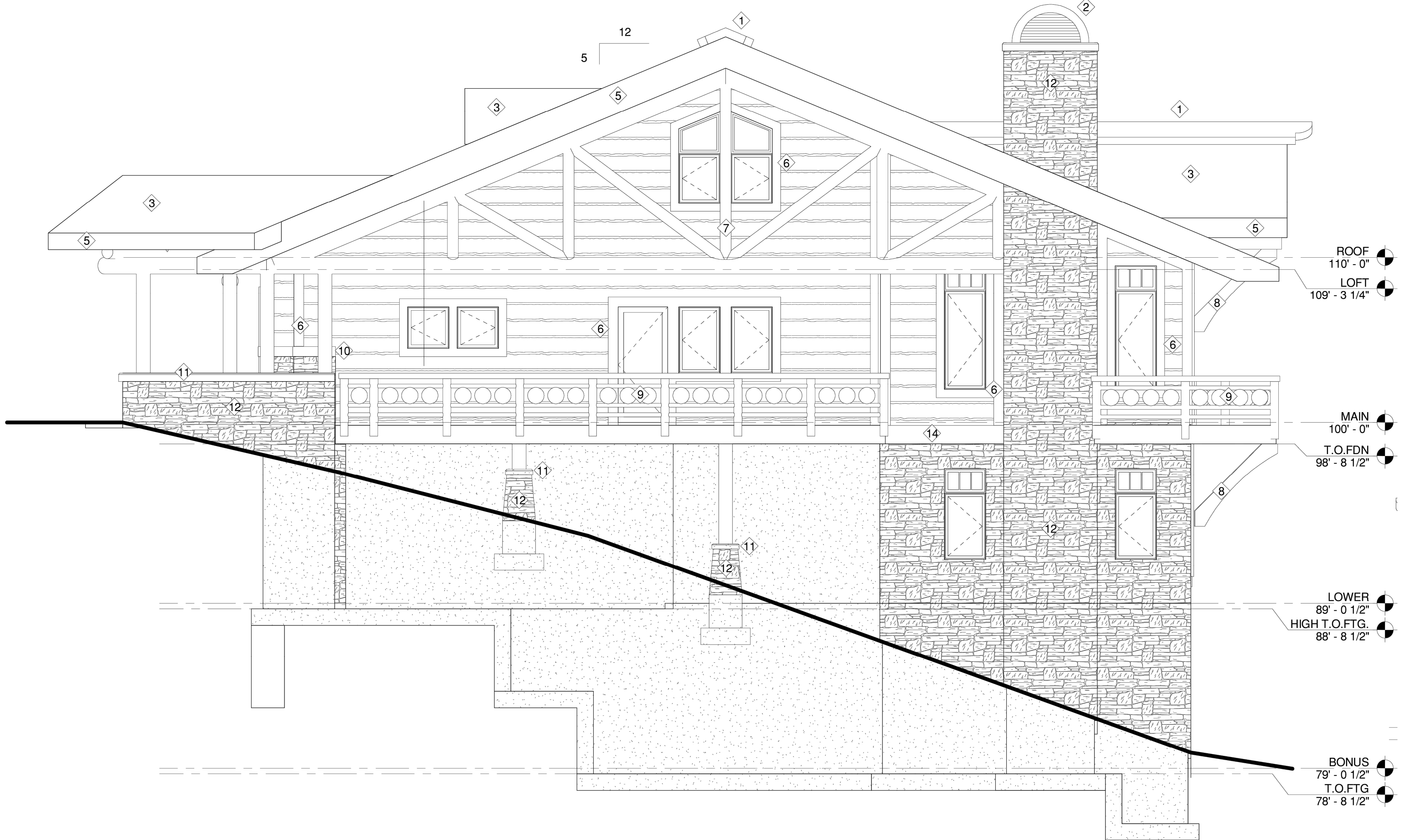
2 WEST ELEVATION 1/4" = 1'-0"

C:\USERS\WILLIAMSON\WORK\ITEMS 2020-2022\SUNDOWN CONDOS - POWDER MOUNTAIN\SUNDOWN CONDOMINIUMS PLAT PHASE 3.DWG