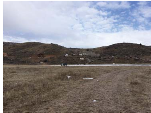
(ABOVE) PANORAMIC LOOKING SOUTH/WEST (LEFT) PARKING LOT LOOKING NORTH